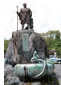
Statue of Shodoshonin