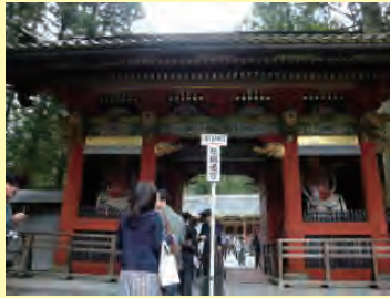
Toshogu Shrine Omote-mon