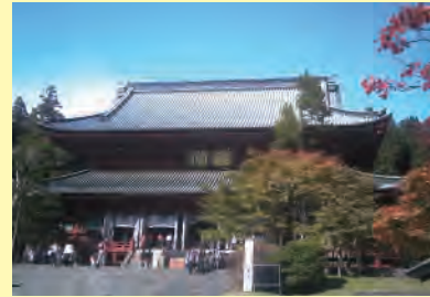
Rinnoji Temple (Under renovation)