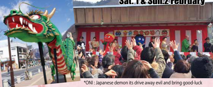
*ONI : Japanese demon its drive away evil and bring good-luck

In Japan, when the season changes from winter to spring, people celebrate the festival of "Setsubun" (literally means seasonal division) by scattering roast soy beans called "Fukumame" as it is believed to cleanse away all the evil spirits or demons which we call "Oni". Kinugawa-onsen can be the best place to celebrate the festival as it actually includes the Kanji of Oni in its name. Please come and join GARAMAKI(Good Luck Throwing) to get a bag filled with "Fukumame" and sweets!